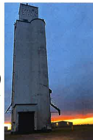
1 st Place Hometown Photo 2022 Lillith Carrol

Explore the 4-H photography project this month and win stuff! Even if you are not currently in the photography project, you can participate. Entries are due on January 3, 2023 and may be emailed ( curry@nmsu.edu ), PM'ed (to the 4-H Facebook Page) or dropped off (at the Extension Office). 1 st – 3 rd place awarded in each category: theme, people, places, bonus (see descriptions below).